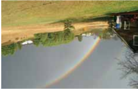
Rainbow with the Ferris house in the position of the pot of gold.