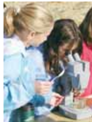
Students inspecting macroinvertebrates at the 2003 Watersheds Festival on the South Fork of the Palouse River.

— PCEI is now a regional AmeriCorps center, responsible for assigning 46 AmeriCorps members to various environmental restoration and education projects in Idaho and eastern Washington.