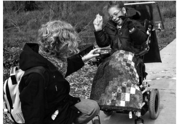
We are honored to see our newly installed wheelchair accessible path provides reasons to smile and educational opportunities for everyone.

This newsletter (ISSN# 1087-9374) is published quarterly by the Palouse-Clearwater Environmental Institute (PCEI). 3rd Class postage paid in Moscow, ID. The Mission of PCEI is to increase citizen involvement in decisions that affect our regional environment. Through community organizing and education, we strive to enable members of our community to find effective and sustainable solutions to local and regional environmental problems.