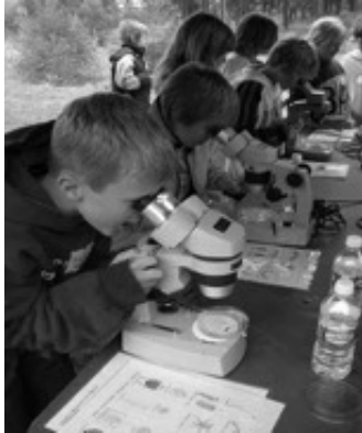
Students study macroinvertebrates during PCEI Education program.

The McCall Outdoor Science School (MOSS) is a collaboration between the Palouse-Clearwater Environmental Institute (PCEI) and the University of Idaho. MOSS is the only publicly operated residential environmental science learning center in the state of Idaho. We use the outdoors as an integrating context for learning about science, place and community. We help schools meet state academic achievement standards by providing academic enrichment in science, math, technology and engineering, as well as language arts and physical education; we also provide opportunities for community building and a chance for experiencing active lifestyles and well balanced meals.