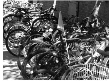
A full bicycle rack in Moscow's Friendship Square.

Go on an oil diet. Like any diet, the trick is to make one change at a time, make it a habit and make it fun. Tune in to what motivates you whether it's staying fit, saving money, saving the environment.