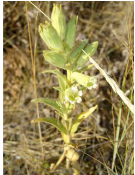
Flowering Spalding's Catchfly. Tracy Brown, PCEI

The seeds were then taken back to the Palouse-Clearwater Environmental Institute's (PCEI) office located in Moscow, Idaho where they were cleaned and counted. A total of 3,188 seeds were counted 388 seeds will be kept at the PCEI site for propagation and 2,800 were delivered to Washington State University. Juanita Lichthardt collected an additional 1,530 seeds from Pitt Cemetery. Of those seeds, 330 will be propagated at PCEI and the additional 1,200 seeds were delivered to the Washington State University Plant Materials Center for propagation.