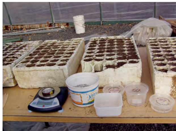
S. spaldingii sowing equipment. Sara Cucksey, PCEI