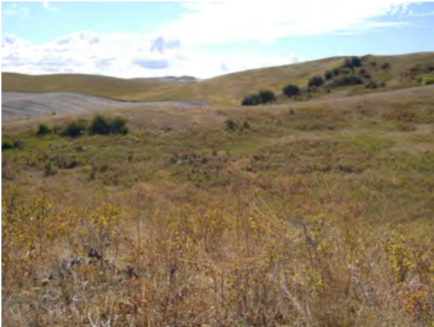
Kramer Prairie, WA.

Seed was collected from Kramer Prairie, a Palouse Prairie remnant, located southwest of Colton, WA. Plants were identified in two distinct patches within the remnant. These patches will be referred to as the "ridgeline patch" and the "lower meadow patch". The plants were still green and many were not ready for collection. Over 300 Silene spaldingii capsules were counted in total at both patches. Capsules were counted if they looked like they were flowering or in condition that appeared as if they contained seed. Using this total number as a guideline, 10% of the capsules were collected.