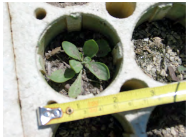
S. spaldingii seedling in styroblock cell.

Each seed container was checked for moisture and misted. No sprouts recorded.