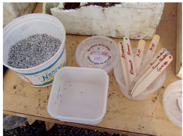
Propagation Materials. Sara Cucksey, PCEI