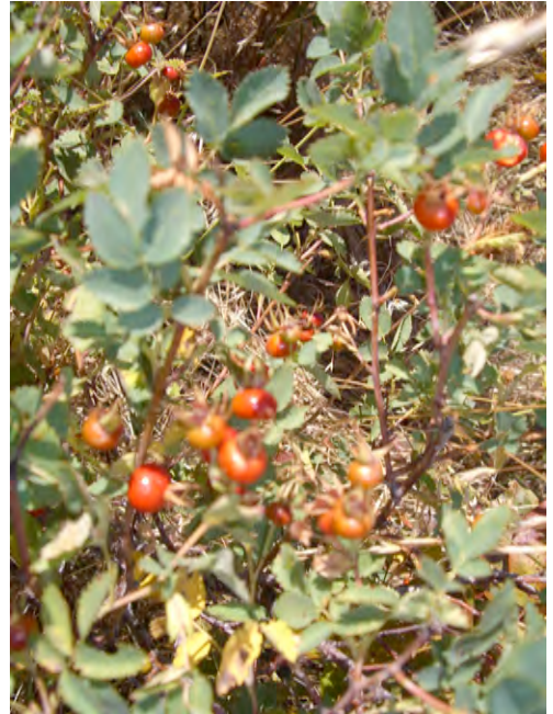
Rosa woodsii, Woods Rose.