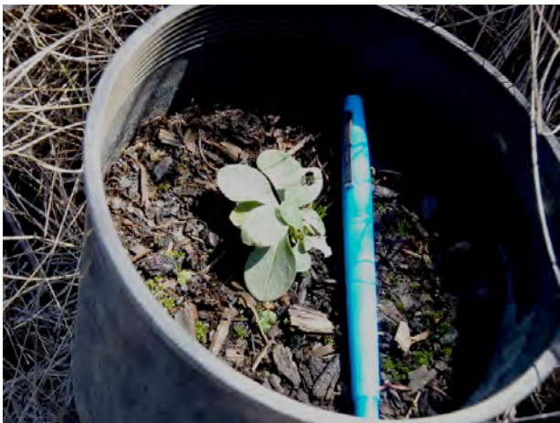
S. spaldingii seedling in 1-gallon pot. Juanita Lichtardt, Natural Heritage Program.

PCEI's watershed crew planted out the contents of 32, 1-gal pots at Rose Creek Preserve on 4 November 2010. All pots had contained Spalding's catchfly plants at one time, although only 8 were showing above-ground growth at the time of planting. Plants originated from a pool of seed collected at Kramer Prairie, Pitt Cemetery, Steptoe Canyon, and Genesee.