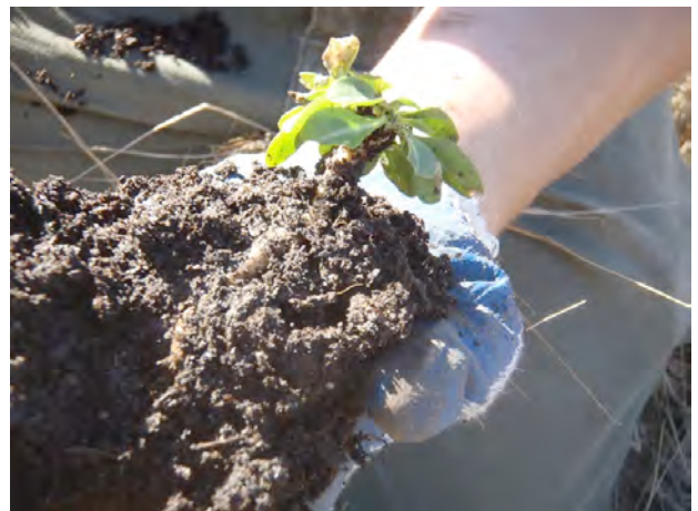
S. spaldingii showing large root. Juanita Lichtardt, Natural Heritage Program.

inserted to mark them. A GPS waypoint was taken at each cluster. On 9 November I returned with six more pots, three with above-ground growth. I planted two with above-ground growth on a slightly more northerly slope than the previous planting; I lost the third seedling. I planted contents of the remaining three pots at the previous site. I checked the earlier plantings and 8 plants were still evident and looked like they had at the time of planting. In all, the contents of 37 pots were planted at Rose Creek Preserve, including 10 with above-ground growth.