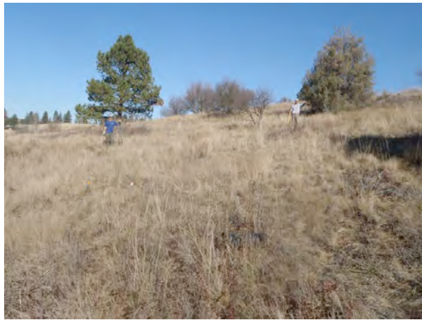
Site 1; AmeriCorps members Zach Johnson and Adam Hein stand at the furthest clusters of plants. Site 2 is just beyond, and to the right of the ponderosa tree. . Juanita Lichtardt, Natural Heritage Program.

The Idaho fescue-bluebunch wheatgrass community into which the seedlings were planted appeared to be in good condition. However, the nearby upper slope is dominated by medusahead ( Taeniatherum caput-medusae ) and there is some teasel ( Dipsacus sylvestris ) in the vicinity. A cursory listing of native species at the site includes yarrow ( Achillea millefolium ), nettle-leaf horsemint ( Agastache urticifolia ), bluebunch wheatgrass ( Pseudoroegneria spicata ), arrowleaf balsamroot ( Balsamorhiza sagittata ), Idaho fescue ( Festuca idahoensis ), Palouse thistle ( Cirsium brevifolium ), black hawthorn ( Crataegus douglasii ), prairie smoke ( Geum triflorum ), little sunflower ( Helianthella uniflora ), houndstongue hawkweed ( Hieracium cynoglossoides ), lupine ( Lupinus sp.), Oregon grape ( Mahonia repens ), ponderosa pine ( Pinus ponderosa ; widely spaced), slender cinquefoil ( Potentilla gracilis ), Palouse goldenweed ( Pyrocoma liatrifomis ), and goldenrod ( Solidago missouriensis ). The following weeds were observed: St. Johnswort ( Hypericum perforatum ), Kentucky bluegrass ( Poa pratensis ), unknown Aster sp., planted junipers ( Juniperus sp.), teasel ( Dipsacus sylvestris ), and ventenata ( Ventenata dubia ).