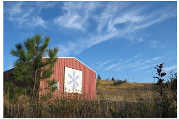
PCEI's barn quilt features a stylized camas blossom. We would like to thank the Latah County Community Foundation and Moscow Building Supply for their generous support of this project.