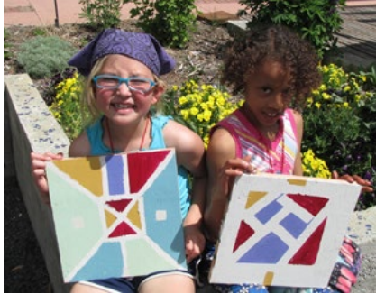
Two artists from PCEI's "Nature and Art Summer Camp" display their own mini barn quilt creations.

Thanks to some talented young artists, the PCEI Nature Center , the 1912 Center , and the Moscow Chamber of Commerce now feature some unique and colorful artwork. Participants in PCEI's "Nature and Art Summer Camp" in June helped