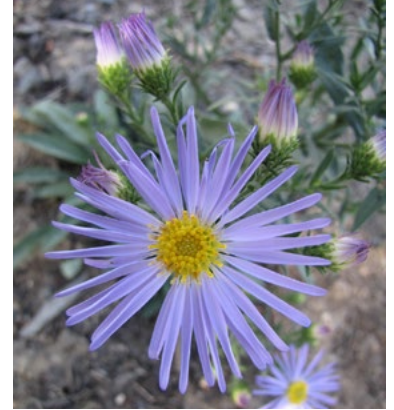
Jessica's aster (Symphyotrichum jessicae), one of several plant species endemic to the Palouse region.

Everything about PCEI encourages a genuinely meaningful, intimate way of seeing and sensing. What an honor and privilege it was for me to draw from its nature gallery. Thank you!