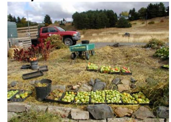
"Ruby" the Biodiesel PCEI truck watches over the Pantry Garden tomato harvest before the first frost of Fall 2007.