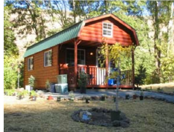
The new Eaton Season Guest Ranch cabin.

Our mission is to connect with people by sharing our passion and love of the land, to educate people about local organic/natural food, and to share with them our way of life. Our ranch is located 15 miles southeast of Pullman, WA on 3,000 acres in the Wawawai Canyon, adjacent to the Snake River. For more information < http://www.eatonseasonranch.com/ >